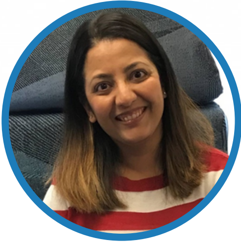
Business Travel Consultant

I've been working with Selective for 8+ years and I've had tremendous personal and professional growth during this time.