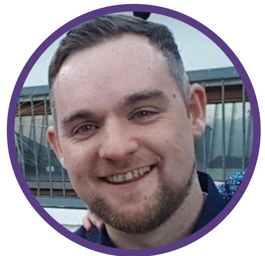
Business Travel Consultant

Fast forward 6 years later I'm working full time from home and I'm now my team's supervisor, helping new comers, management, accounts and my own team.